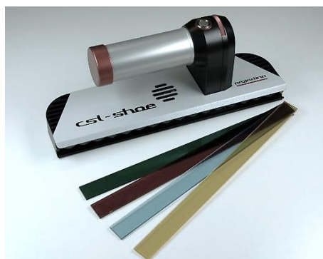
Color filters for contrast enhancement