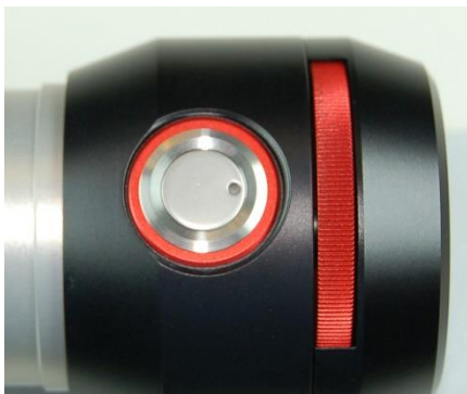
CSL-Shoe power button and dimming wheel